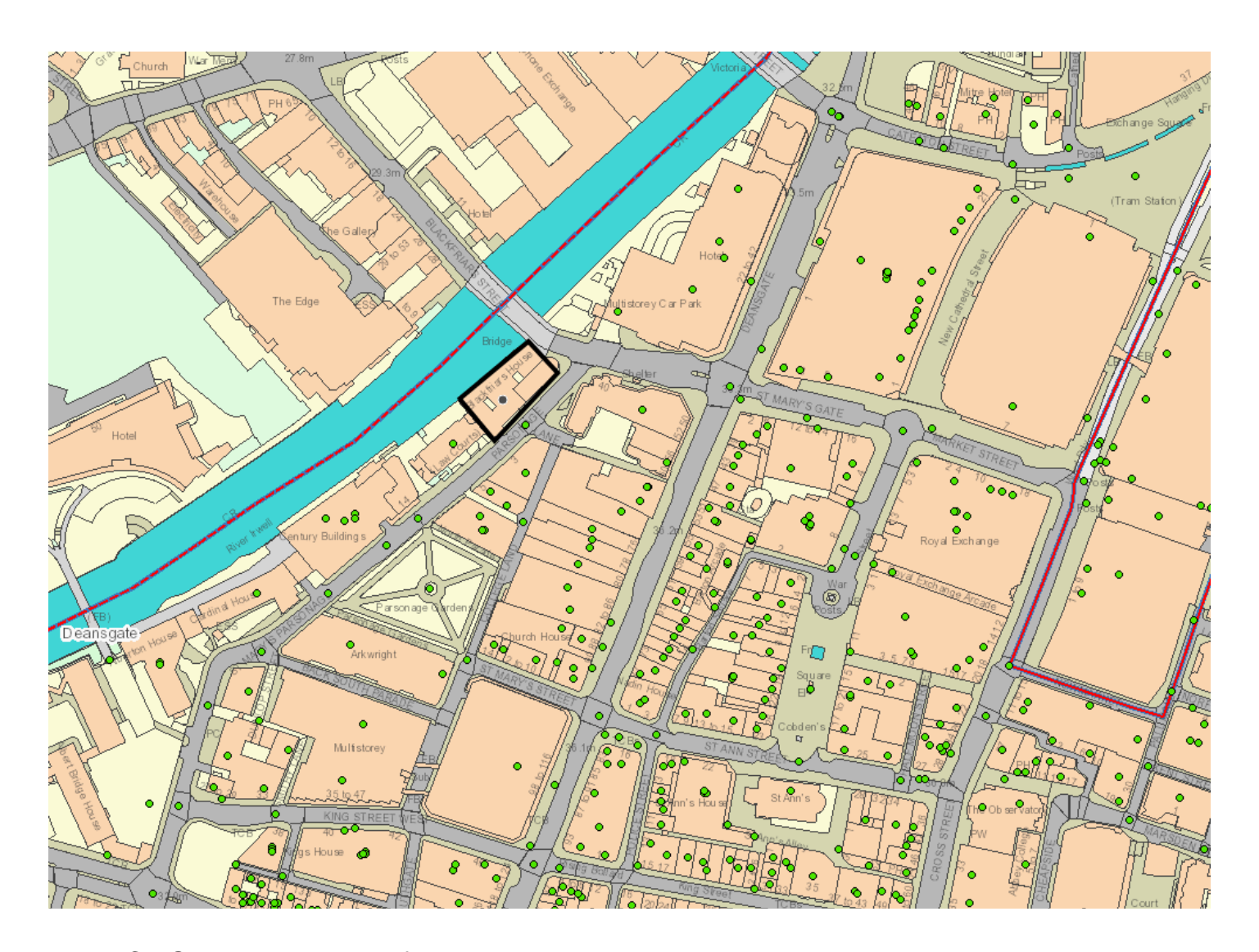
TBC - Ground Floor & Roof Terrace Ground Floor & Roof Terrace, Blackfriars House, Parsonage, Manchester, M3 2JA

Premises Licensing Manchester City Council